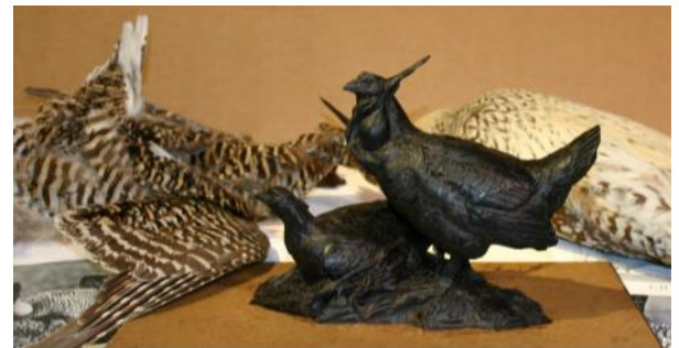
Wax stage This Dance is Taken Maquette Prairie Chickens 7" x 7" x 4" Edition 50