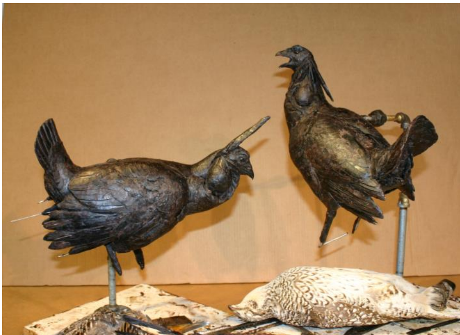
Early Models of life size Prairie Chickens

I am presently working on several sculptures of Prairie Chickens for my retrospective Rendezvous Show April 2015 at the Thomas Gilcrease Museum in Tulsa, Oklahoma. I have completed a three piece maquette of different Prairie Chicken dance gestures, titled This Dance is Taken pictured below right. Two life size birds are in the works to complete this exploration. All of our wonderful prairie grouse need conservation attention, they are big birds with an even bigger place in our Western Heritage.