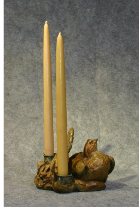
West of the Pecos Bobwhite Quail & Horned Toad Life size Edition 48